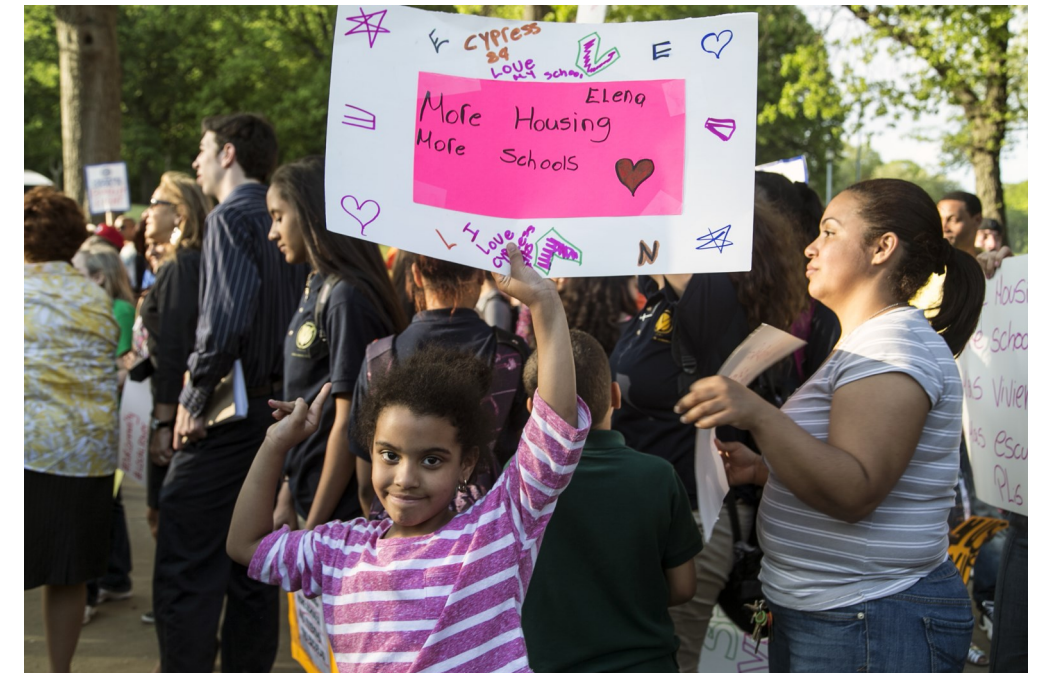
A young Cypress Hills resident rallies for her community in Highland Park.

Leadership —We help local residents to develop as leaders, invested in the future of their community and working together for positive change. This year, members of Future of Tomorrow, our student organizing group at the Lane High School campus, spoke in front of the City Council about the consequences of harsh disciplinary codes for students, raising awareness around restorative practices in schools. After their day of testimony, the City Council increased their budget for restorative justice programs in schools to $2.4 million. FOT also hosted workshops with school safety agents and teachers to open a dialogue about how to improve their schools. Partnering with school safety agents is a groundbreaking step in establishing restorative practices and a culture of positive discipline at the Lane campus.