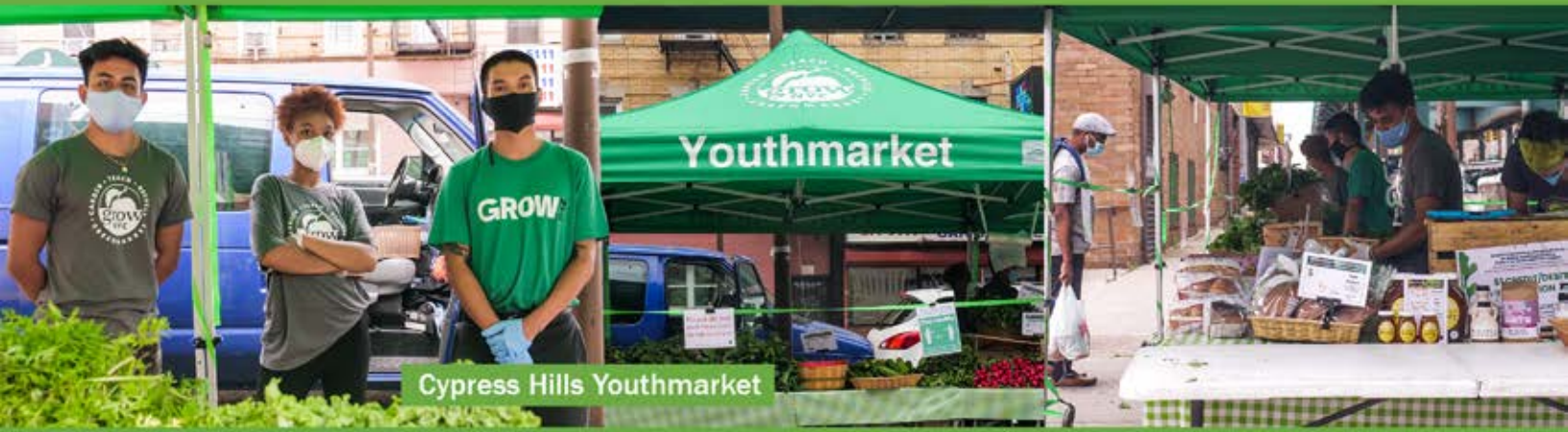
Cypress Hills Youthmarket

The Community Development division remains committed to expanding access to affordable housing while also building a healthier, more energy-efficient Easy New York. Construction on Chestnut Commons began in FY 2020, with CHLDC as a co-developer. Chestnut Commons will make available 274 additional units of permanent and deeply affordable housing in Cypress Hills while also adding a full-service community center and neighborhood retail space. The residential portion of the building will be built to Passive House energy efficiency standards.